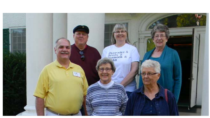
Ethnic Festival at Arbor Lodge 2015