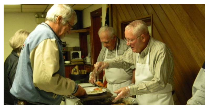
November Broda Dinner 2015