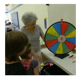
Youth Fun Night